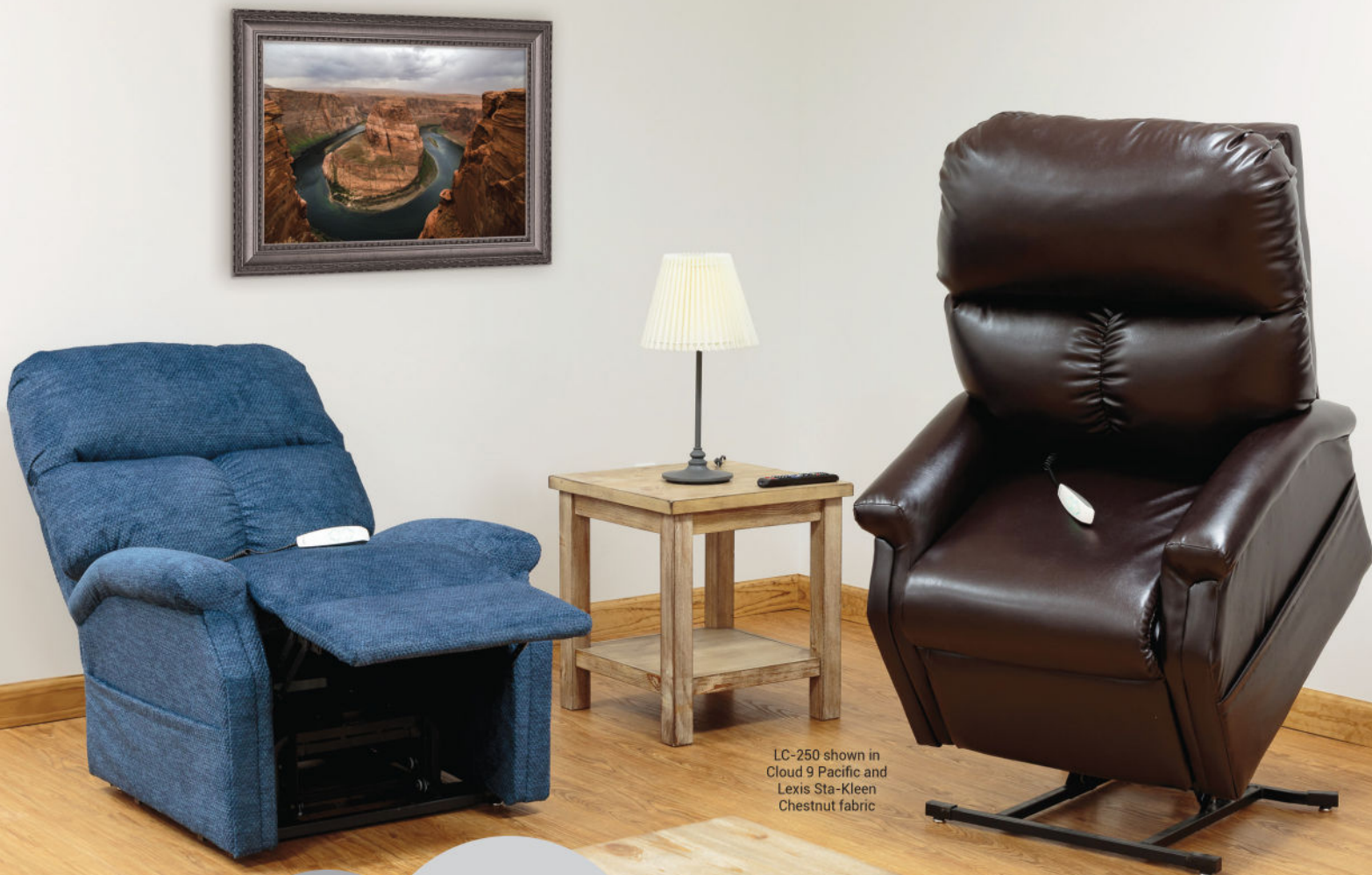
LC-250 shown in Cloud 9 Pacific and Lexis Sta-Kleen Chestnut fabric

Protect your investment with the Pride® Power Lift Recliner Care Kit