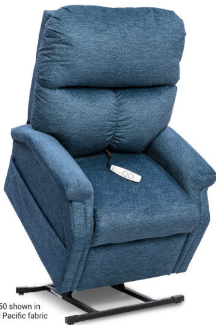
LC-250 shown in Cloud 9 Pacific fabric